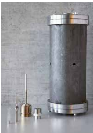
Figure 1: Large and small viscosity sensors: the vibrational characteristics are changed by a fluid interacting with the vibrating structure

Our research focuses on analytical and numerical modeling of mechanical systems and corresponding experiments. We determine the properties (density, viscosity, viscoelasticity) of a fluid by quantifying its interaction with a vibrating system. We also study the vibrational characteristics of water turbines and, at smaller scales and higher frequencies (MHz), we work on modeling and design of devices for ultrasonic particle manipulation. Further areas of research include the study of wave propagation in structures and thin films (nanosonics), as well as time dependent phenomena in snow mechanics.