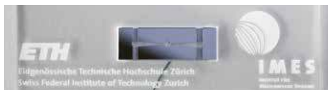
Figure 4: A microcavity etched into a silicon wafer is used as a precise chamber for ultrasonic manipulation of particles.

Our group forms part of the Institute of Mechanical Systems. It consists of eleven doctoral students and two postdocs. Experimental work is conducted in dedicated labs, where doctoral students with similar topics work together with common equipment. There are currently six laboratories dedicated to wave propagation, micromanipulation, fluid characterization, nanosonics, biochemistry and water turbines. To facilitate communication and discussion within the major groups, monthly meetings are held with all group members. Wherever possible, infrastructure is also shared with neighboring institutes. Dr. Stefan Blunier runs the CLA part of the Frontiers in Research: Space & Time (FIRST) clean room facility, a shared facility for fabricating microstructures like acoustic manipulation devices. I am also part of the FIRST management team. Within the Institute we share minimal infrastructure consisting of one secretary, one technician and one electronics engineer. Computers are coordinated and administered by Dr. S. Kaufmann, together with a part-time external member of staff. Dr. Kaufmann also helps us to carry the very large load of teaching, along with a group of over 40 student assistants.